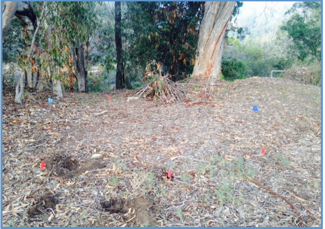
Proposed wetland demarcated with wire flags.